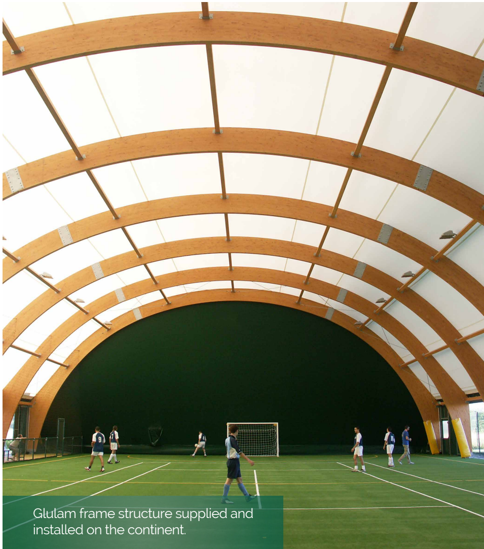
Glulam frame structure supplied and installed on the continent.